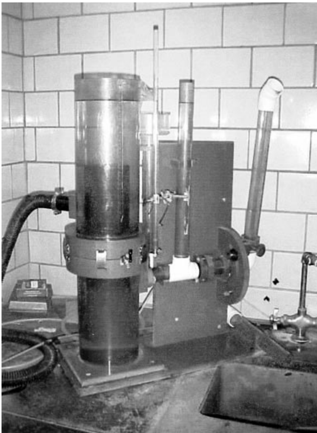
FIG. 1 Constant and Falling Head Permeability Apparatus

9.2.2 Take specimen A at the center of the sample, B at one corner (center located 200 mm (8 in.) from the corner), C midway between A and B, and D the same distance from A as C, located on a line with A, B, and C.